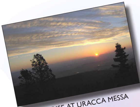
SUNRISE AT URACCA MESSA by Wally Adelman

Twenty-four excellent photographs were submitted in this our first Shampoo February Photo Contest. You chose these five as winners.