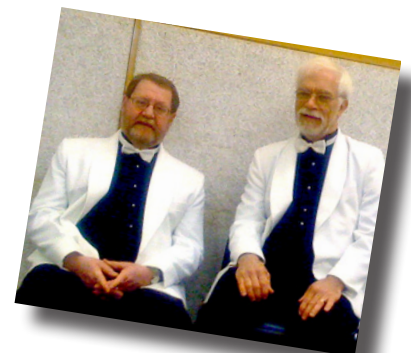
Ready and Waiting to Get Their Six Minutes in the Contest Spotlight