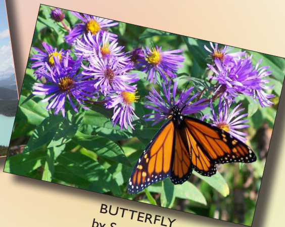
BUTTERFLY by Sandy Lane